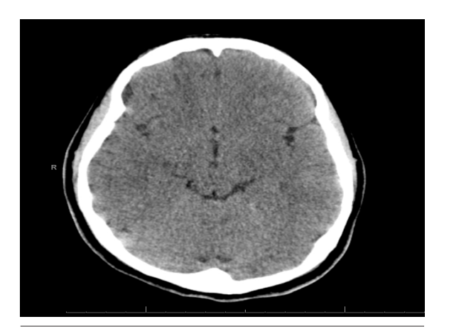
Figure 3: Normal brain computed tomography scan.

amphetamines, methadone, and barbiturates were all negative. Brain computed tomography [Figure 3] and chest radiography were also unremarkable. All her laboratory investigations were normal apart from low bicarbonate (17 mmol/L) and elevated lactate (3.5 mmol/L).